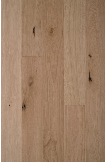
CC101 LAKE PLACID