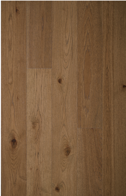
CC107 BLUE RIDGE