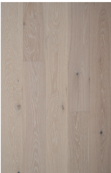
CC106 GRAND LAKE